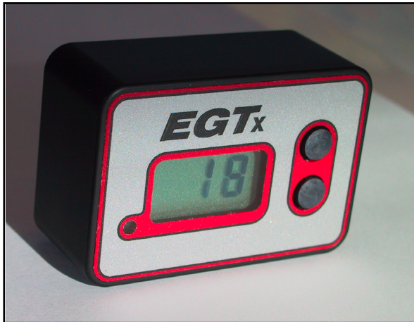
Picture-1 EGTx Exhaust Gas Thermometer

EGTx is a one channel battery powered microcontroller based exhaust gas thermometer. It is designed for use with any K-type thermocouple sensor.